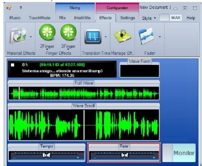
Figure 1. Open Interface of the mixing interface, showing how the songs selected are decomposed into their wave forms, the tempo, rate, volume controllers, special effects controllers and other controllers relevant to music mixing. The monitor buttons, when selected requests the crowd to participate in the music selection.

As mentioned in the introduction, two different interfaces were designed and built: an open interface, providing transparency to the DJ's actions and a "closed" interface whose control was hidden from the audience, by the display of an oceanic scene. The open interface permits the DJ to perform the typical music mixing tasks: such as play two sound tracks simultaneously, cross fade between the tracks, open and select songs to play, control the tempo and rate of each track independently, seek in a track to a specific cue point, and add special effects (the special effects are related with the cloth recognition mentioned previously). The open interface is presented in Figure 1. The open interface can also actively motivate the crowd to participate in the music selection process. The interface is designed so that the DJ can stroll over songs and the crowd can applaud or boo the song, showing their support or displeasure (the interface presents a dialog requesting feedback from the audience for this music selection, although it can be enabled or disabled according to the DJ's criteria).