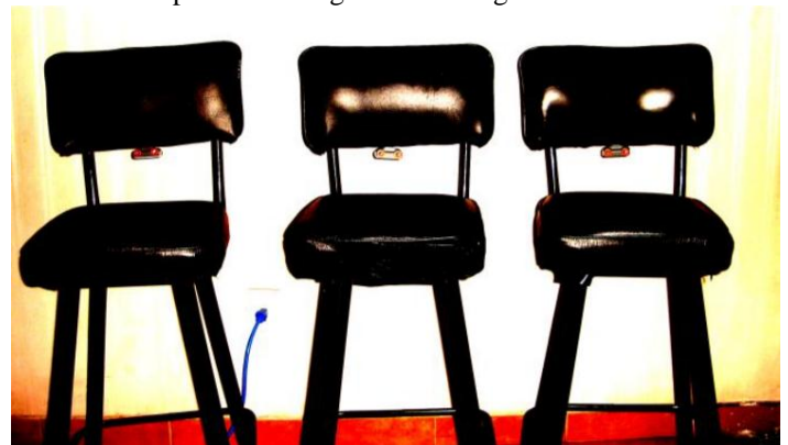
Figure3 This figure presents the sonar sensors that are placed on the chairs of the event detecting if a person is sitting. The sonar sensors are placed in the back upper portion of the seats and are connected to the ground. There is cabling in the ground leading to the server that makes sense of this data and then displays it to the DJ.

Certain tasks were selected for the DJs, and certain tasks were selected for the people in the crowd. Each DJ was asked to select five times two songs and mix them with the open interface and another time with the closed interface. The DJ was also asked to add effects using the gloves made of different materials. The DJ was asked, while on the open interface, to request feedback from the crowd for the music selection. After their performance the DJ was interviewed about his/her experience in the intelligent environment and was asked to describe the people in their crowd. The people playing the crowd on the other hand, were requested to dance and sporadically sit on the available chairs in the room. All of the participants were interviewed afterwards and questioned about their experience being in the intelligent environment.